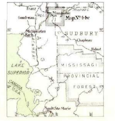
Scale: 75 miles = 1 inch.